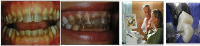
Figure 4: Heavy tetra-cyclin stained teeth.