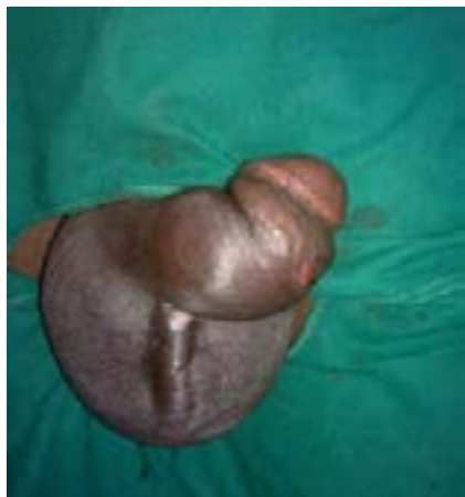
Figure 1: Swelling of the penis with deviation to left.