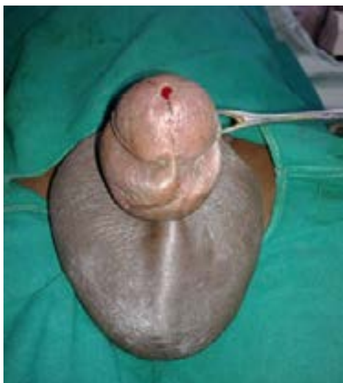
Figure 2: The blood was noted in the external urethral meatus.