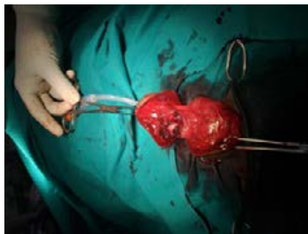
Figure 4: Surgical exploration showing urethral injury and the injury of tunica albuginea and corpus cavernosum.