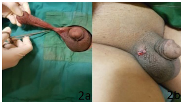
Figures 2a and 2b: a) Giant acrochordon preoperative. b) Immediate post-operative.