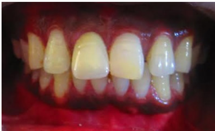
Figure 4: Postoperative photograph showing PFM capping with right central and composite restoration with left maxillary central incisor.