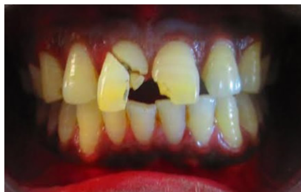
Figure 1: Preoperative photograph showing complicated crown fracture of right maxillary central incisor in the cervical third and Ellis class II

A 22 year male reported to the department of conservative dentistry & endodontics, Maitri college of dentistry & research center, with the chief complaint of pain and mobility in upper front region since 2 hours. History revealed trauma resulting from a skateboarding accident that occurred 2 hours earlier. There was soft tissue injury on extra oral examination and intra oral examination revealed crown fracture of both the maxillary central incisors (Figure 1).