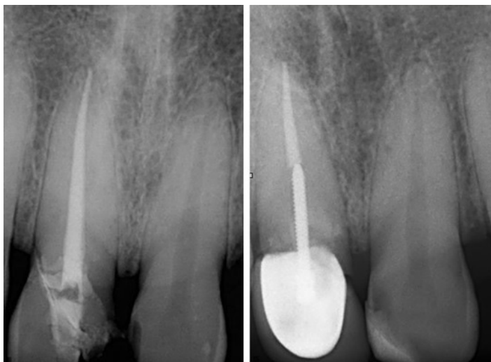
Figure 2: Complete obturation was done with right maxillary central incisor.

A detailed explanation about the treatment plan was given to the patient, which included endodontic treatment, then post. The treatment plan was accepted by the patient and consent was taken. Local anesthetic was administered and the fracture segment was removed. Pulp tissue was extirpated and cleaning and shaping was done. The root canal was enlarged to ISO size 40 at working length. During biomechanical preparation, the canal was irrigated with sodium hypochlorite. The root canal was dried with paper points and obturation was completed in a single visit (Figure 2). The root canal was then prepared with peeso reamer to receive a post. The prefabricated metal post was tried in the canal, adjusted and then placed followed by PFM Capping (Figure 3). Maxillary left central incisor was then restored using composite resin restoration. The tooth was polished with the polishing disc. Occlusion was checked and post operative instructions were given (Figure 4). Clinical and radiographic examinations were carried out after 1 month, 3 months, 6 months and the tooth responded favorably (Figure 5).