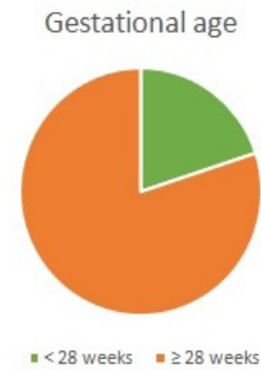
Figure 2: Distribution of gestational age of study population (n=1054)

and 19.92% were < 28 weeks of gestation. The difference was statistically significant ( P < 0.05 ).